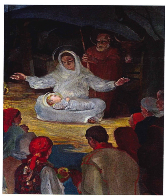
Altarpiece in the church of Saint Mark, Zagreb, Croatia.

Green and Red, the colours of Christmas! These colours probably originate from the holly; evergreen leaves and red berries, and may be pre-Christian. The winter solstice (in Northern Europe) will have been celebrated with green as the colour of hope and new life. Christianity has adopted the colours since they easily represent Christ's crown of thorns, and the spots of blood. White also has its place in the purity and innocence of Christ. Other colours of Christmas include blue for Mary (cf previous issues of 'Clarion') and gold for the gifts brought to the Crib. Green, is liturgically represented as the colour of Ordinary time.